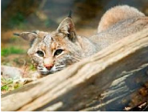
A Bobcat carefully watches its prey before pouncing.

This is an excerpt from New Jersey Threatened and Endangered Species Field Guide published online by the Conserve Wildlife Foundation of New Jersey. This searchable database is available at www.conservewildlifenj.org/species/fieldguide/