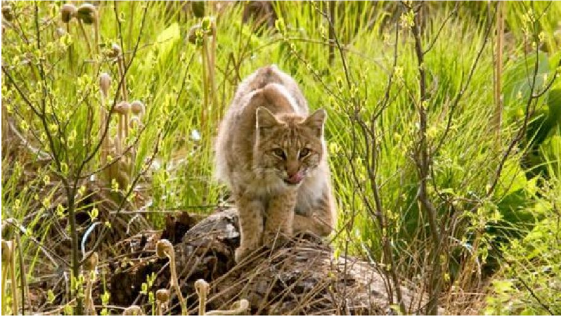
The elusive bobcat is spotted in its native habitat.

Since 1991, our management efforts have led to consistent bobcat sightings from an increasingly larger area of northern New Jersey. Most sightings continue to come from Warren, Sussex, Passaic and Morris counties but there have been recent sightings from Bergen, Hunterdon, Ocean, Cape May, Cumberland and Salem counties. Although too early to tell whether the increase in sightings is due to more people encroaching into areas where bobcats live, it is possible that the increase in sightings may be an indication that the once nearly extinct population is growing.